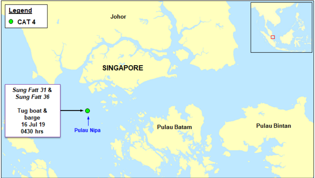
Location of the incident on 16 Jul 19

During 9 – 15 Jul 19, one CAT 4<sup>1</sup> incident of armed robbery against ships was reported to the ReCAAP ISC. The incident involved the theft of scrap metal from barge Sung Fatt 36 towed by tug boat, Sung Fatt 31 on 16 Jul 19 in the westbound lane of the Traffic Separation Scheme (TSS) of the Singapore Strait. The location of the incident is shown in map below, and description tabulated in the attachment. This is the second time in 2019 that Sung Fatt 36 was boarded by perpetrators while underway in the westbound lane of the TSS of the Singapore Strait. The first incident occurred on 5 Mar 19 when 11 perpetrators boarded Sung Fatt 36 also towed by Sung Fatt 31 and stole some scrap metal from the barge.